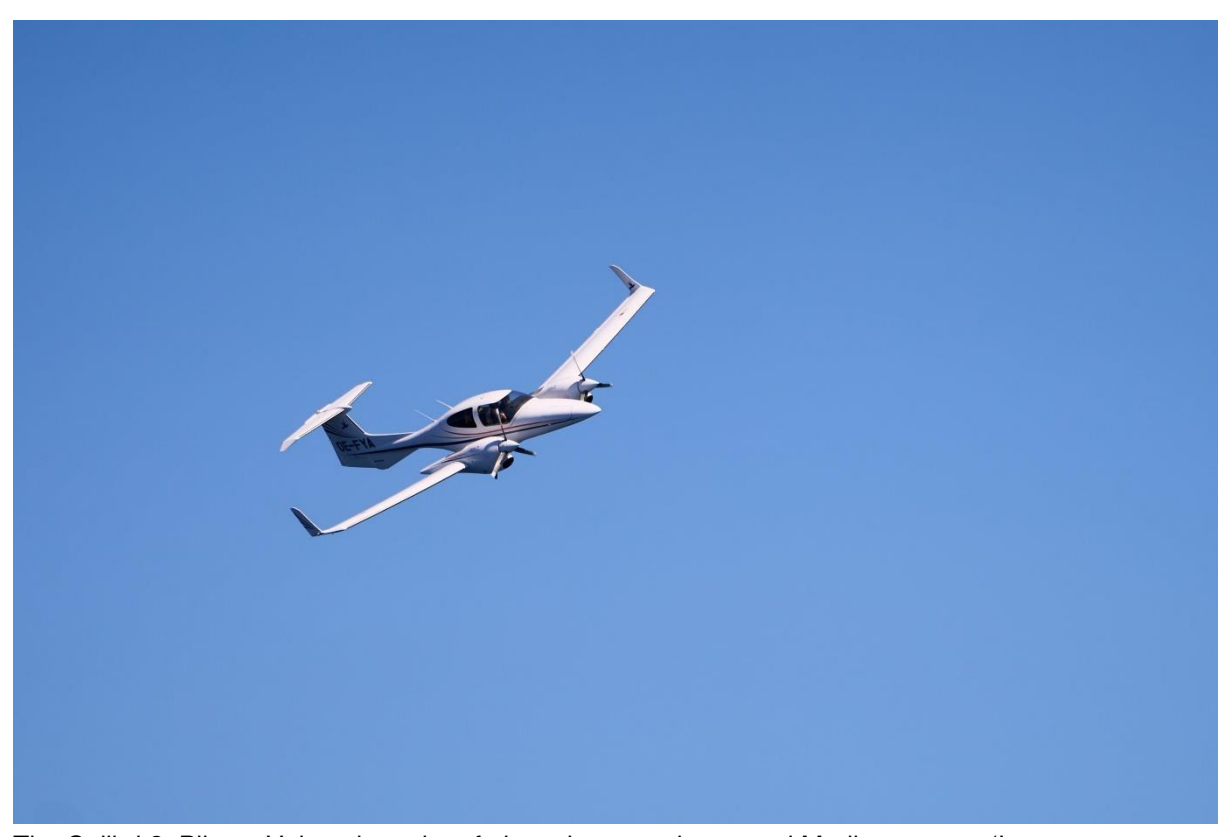
The Colibri 2, Pilotes Volontaires aircraft, in action over the central Mediterranean.

RESQSHIP is back on rotation with the NADIR. To rescue as many people in distress at sea in the central Med as possible, we are working closely with other organizations again this year. One of these is Pilotes Volontaires - a French NGO that supports our work from the air and makes an indispensable contribution to our search for boats in distress.